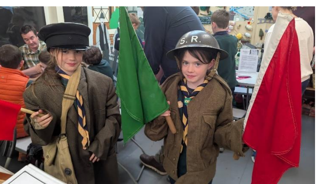
In the rest of term we are looking forward to summer camp, cycling, orienteering, and more fun, games, and teamwork.

Many thanks for all the parents for their support, and to all in the 3<sup>rd</sup> Alton team.