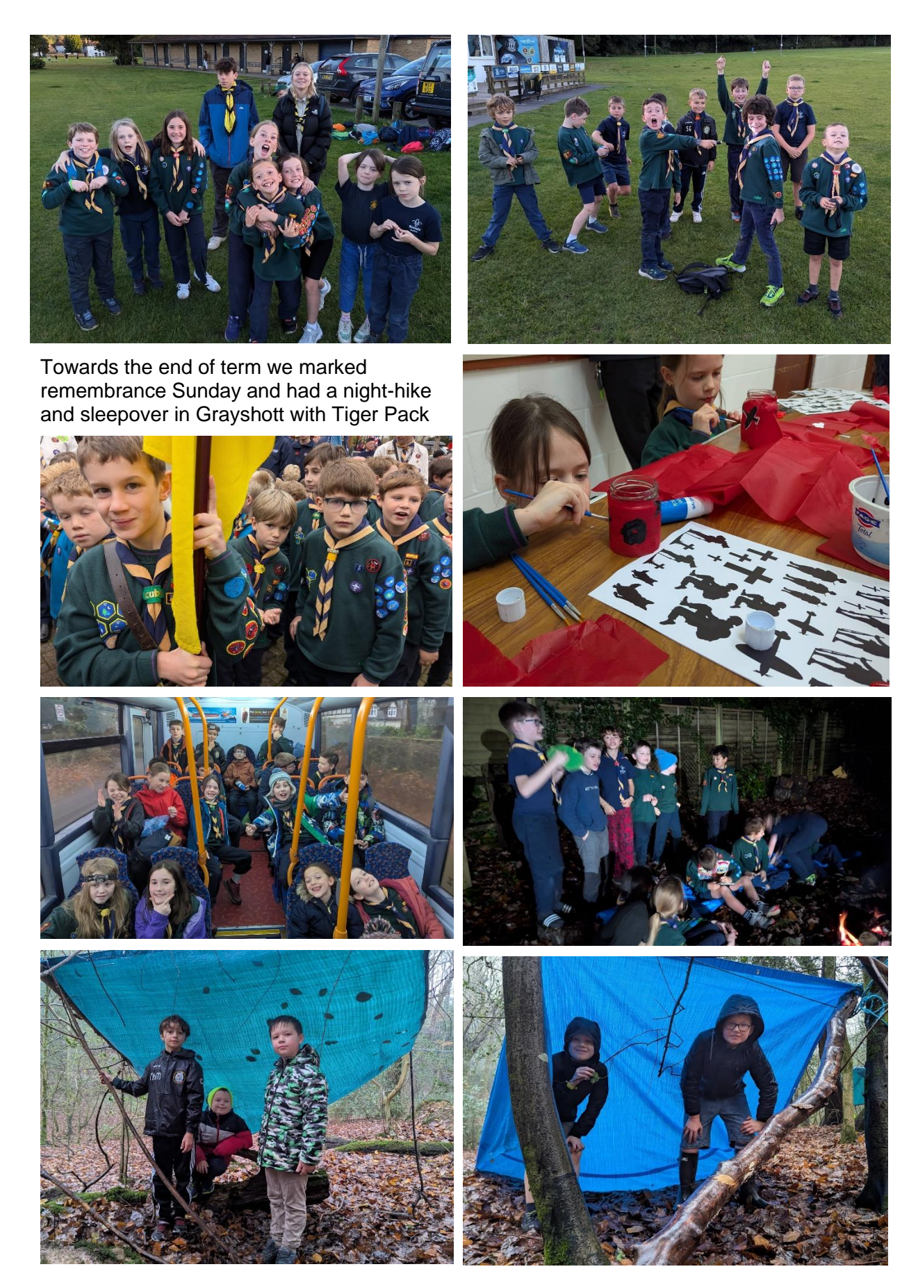
Sleepovers and camps are essential for completing the Outdoors and Adventure challenge awards and of course count towards Night Away and (usually) Hikes Away badges. At the end of term Cubs had to achieve rescue from the Moon in an epic adventure and use skills from badges such as Teamwork , Skills , Communicator , Scientist , and Navigator .