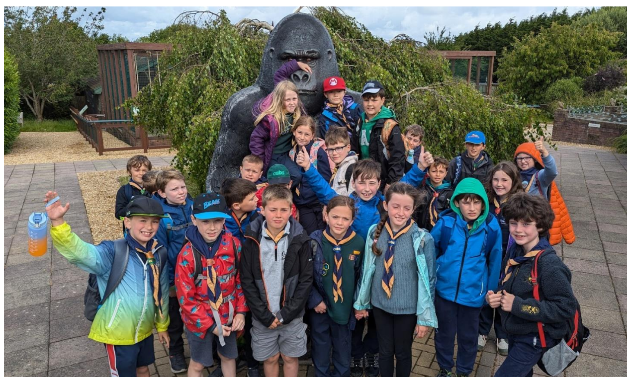
The term's programme focussed on environmental challenges, with the pack helping to understand how small changes can make big changes at both the local and global level.